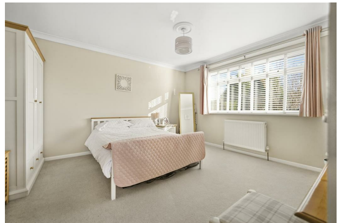
Double bedroom with coved ceiling, radiator, space for wardrobes and window to rear.