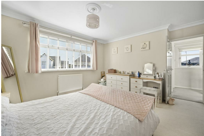
Bedroom two 13'20 x 14'48 (3.96m x 4.27m)