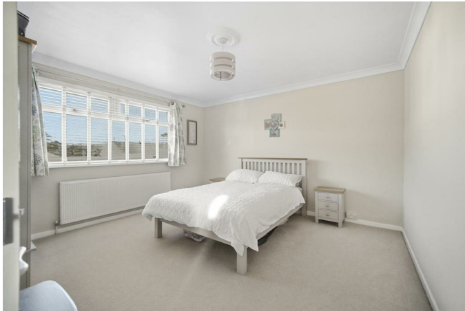
Double bedroom with radiator, coved ceiling, attic hatch, space for wardrobes and window to front.