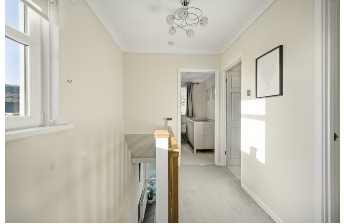
With coved ceiling, window to side and storage cupboard.