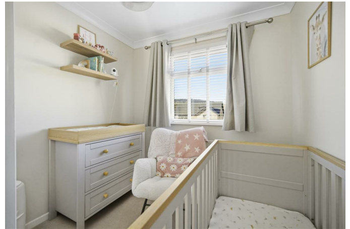
With storage cupboard, coved ceiling, radiator and window to front.