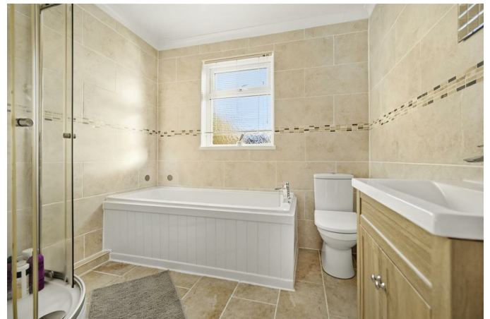
Fitted with four piece suite to include panelled bath, corner shower, low level wc, pedestal wash hand basin, fully tiled walls, tiled flooring, heated towel rail and window to rear.